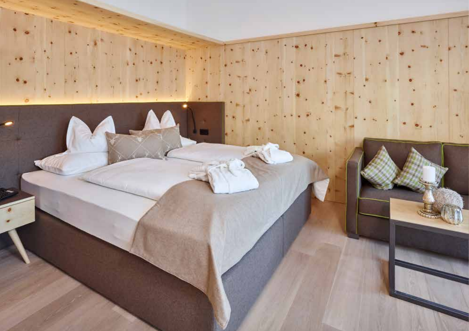
Doppelzimmer superior 25 m 2