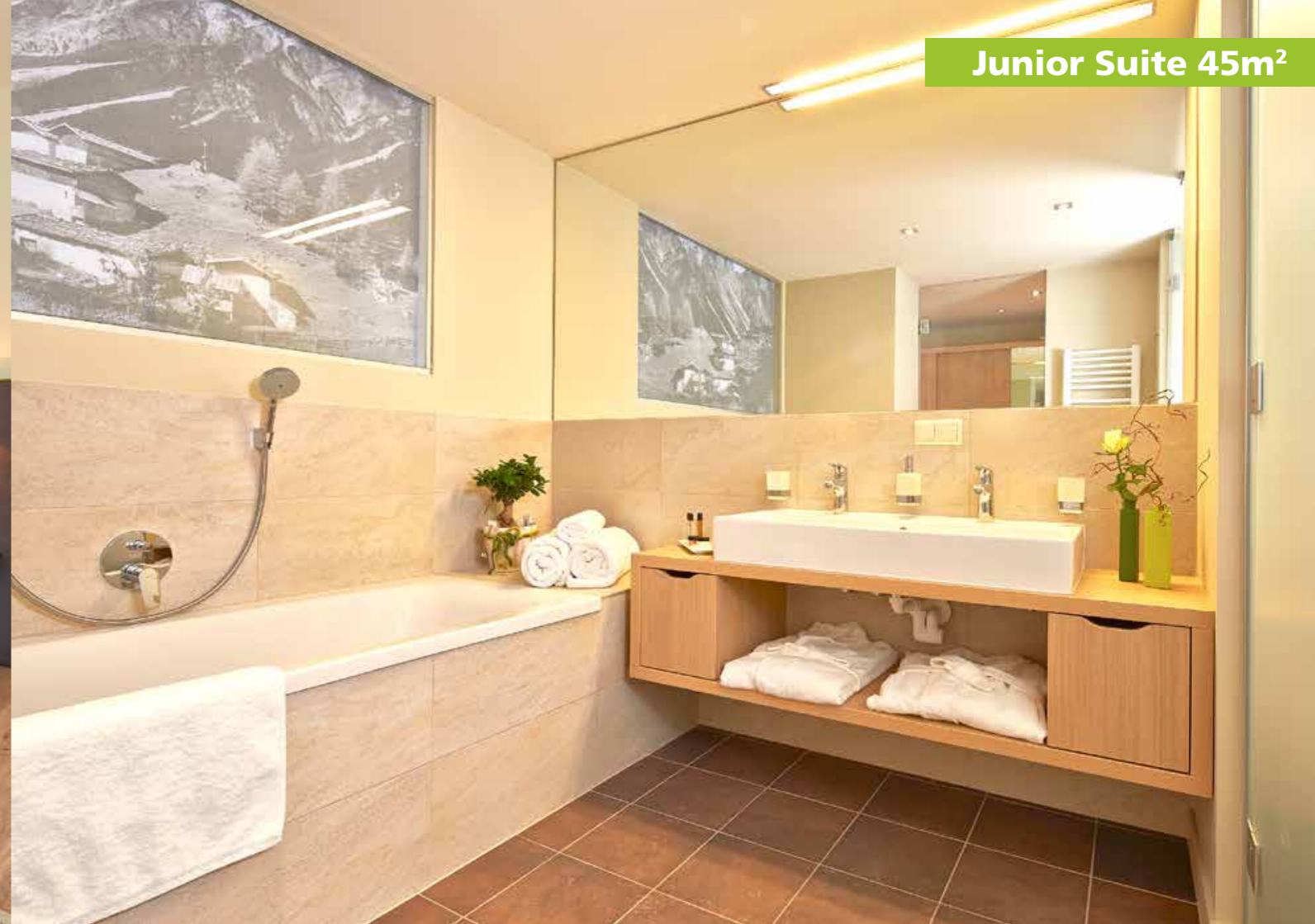
Junior Suite 45m 2